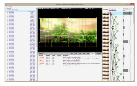
Parabola Explorer main window

Industry-leading HEVC / H.265 video bitstream analyser, visualization and conformance test tool. Created by HEVC gurus for those needing insight into this new and complex video compression standard.